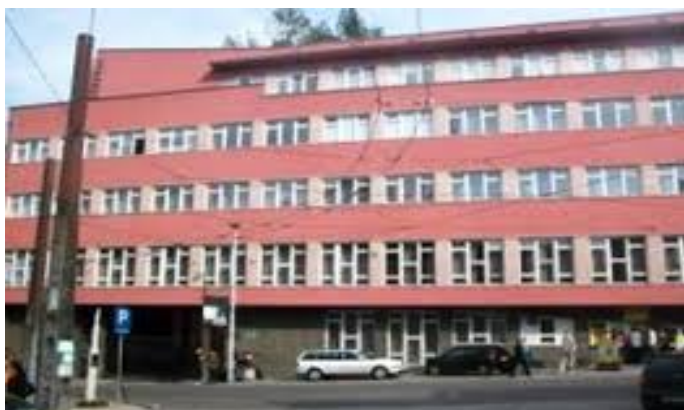
Academy of Sciences and Arts of Bosnia and Herzegovina